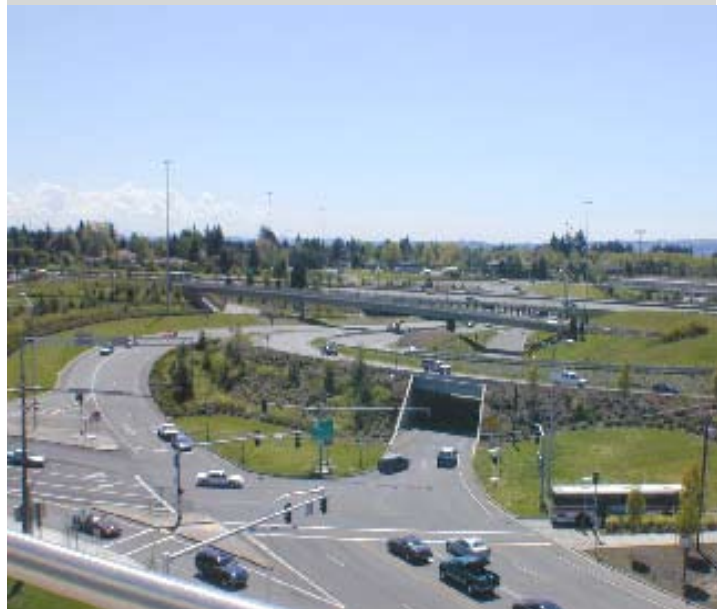
IMMEDIATE ACCESS TO HWY 217, 26 & LIGHT RAIL