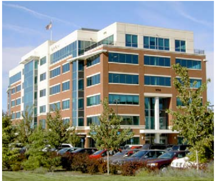
GENEROUS FREE PARKING